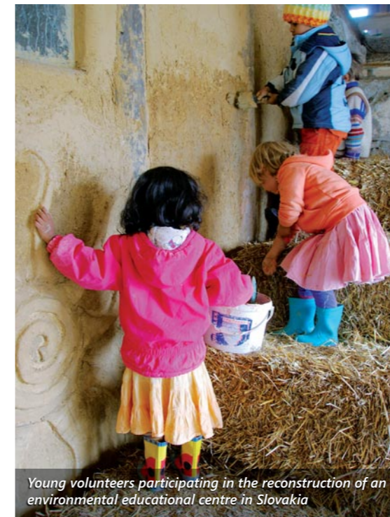
Young volunteers participating in the reconstruction of an environmental educational centre in Slovakia

Non-governmental organisations (NGOs) are widely recognised as an important part of the framework supporting democracy and a just society. Whether as a watchdog or as a vehicle for advocacy and policy implementation, NGOs and other civil society organisations today play an essential role in ensuring the transparency, accountability and effectiveness of public policies.