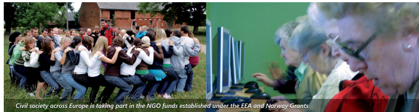
Civil society across Europe is taking part in the NGO funds established under the EEA and Norway Grants

By sharing experiences and creating strong partnerships between NGOs, enterprises and universities, the project "Efficient NGOs, viable society", aims to strengthen Estonian NGOs' capacity. Through impact and capacity assessment, stimulating legitimate partnerships and offering continuous support to the partners, some 20 organisations are set to benefit from the support.