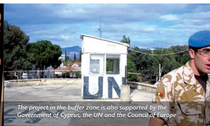
The project in the buffer zone is also supported by the Government of Cyprus, the UN and the Council of Europe