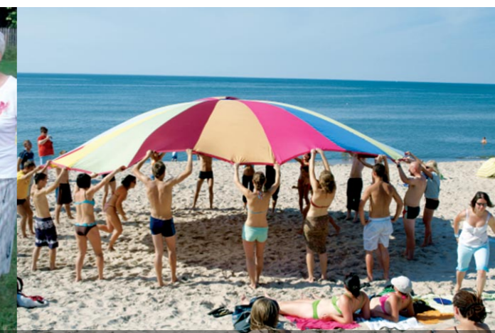
With 19 NGO funds established in 12 beneficiary states, the EEA and Norway Grants are primary supporters of civil society in Central Europe