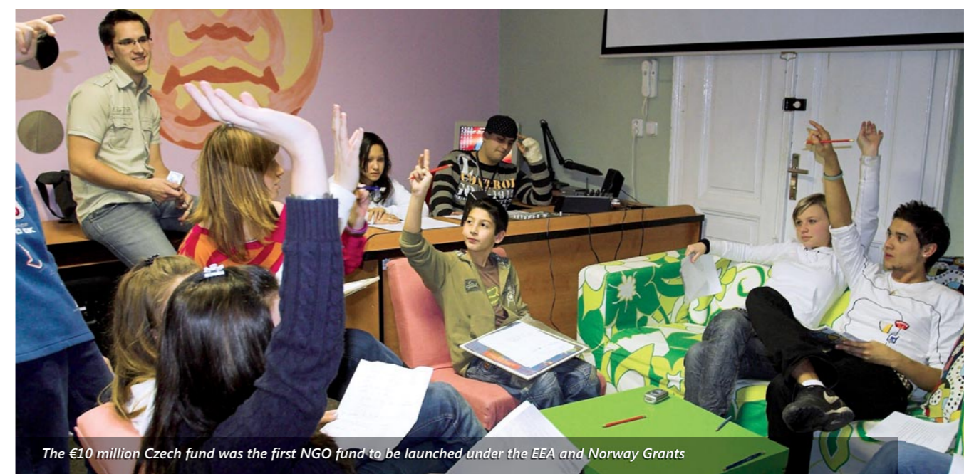
The €10 million Czech fund was the first NGO fund to be launched under the EEA and Norway Grants

The open calls have so far been met with great interest from NGOs. In the immediate aftermath of the cold war, Central and Eastern European countries saw a surge in support from foreign donors. However, after becoming members of the EU, many of the donors have pulled out to pursue projects further to the east and south. The support from the EEA and Norway Grants has therefore become even more important in order to prevent a young and fledgling civil society from being hampered by a lack of funds, and contribute to its continuous development.